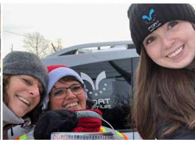
Media Food Drive Partnership with the Comptoir alimentaire de Sept-Îles