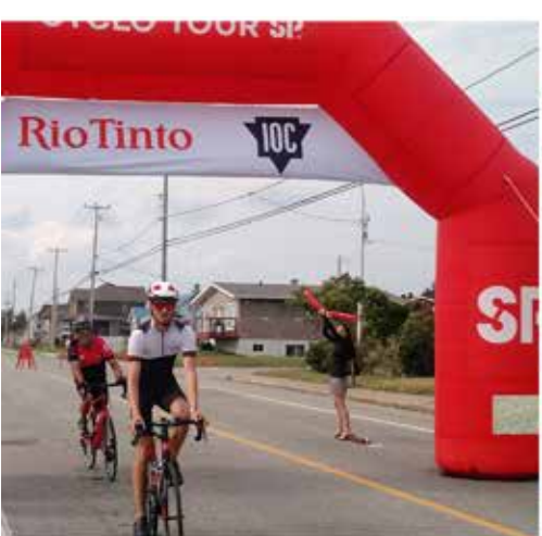
MS Bike (for multiple sclerosis) Partnership to support medical research