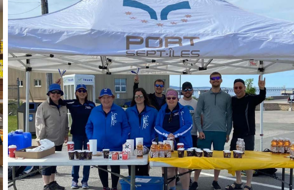
OMHSI Children's Christmas Grande guignolée des médias Marathon Mamu